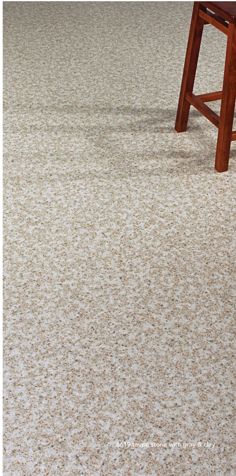
6619 taupe stone with gray & clay