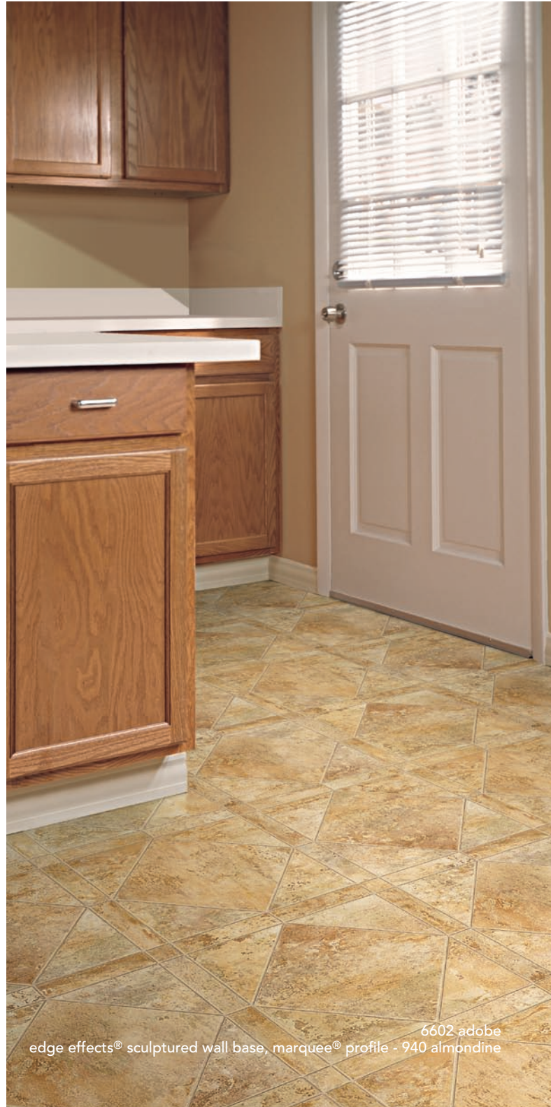
6602 adobe edge effects® sculptured wall base, marquee® profile - 940 almondine