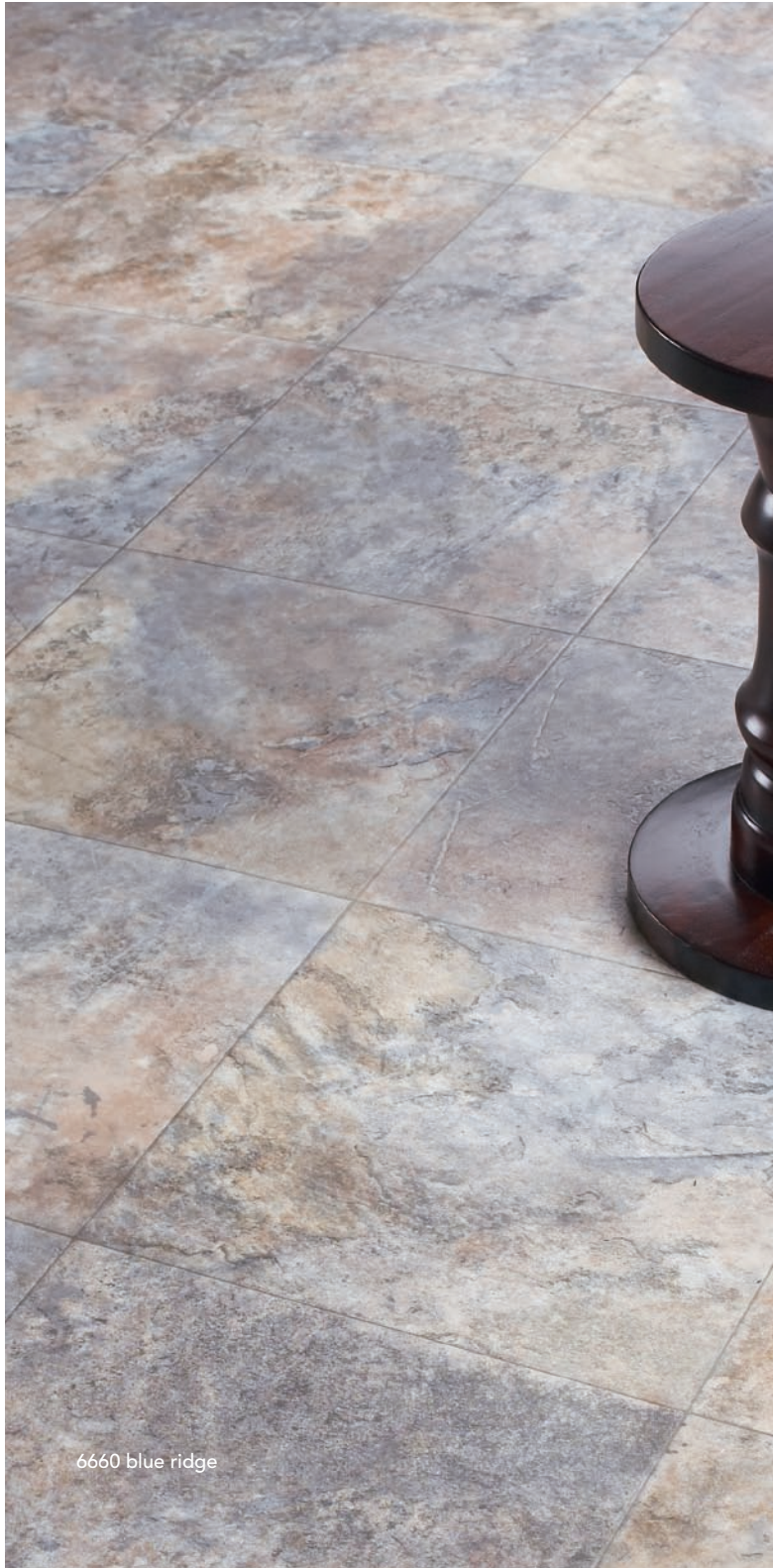
6660 blue ridge