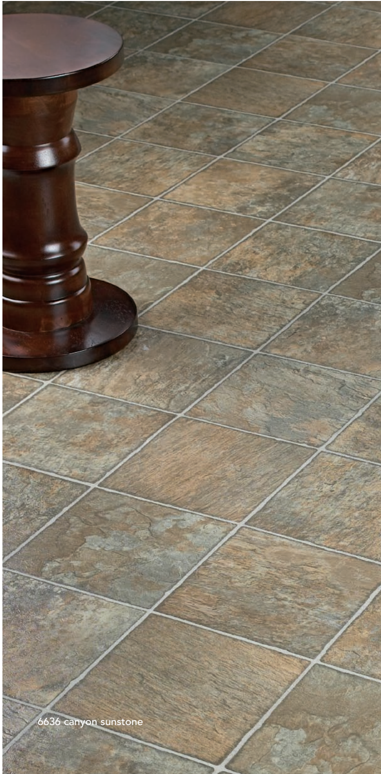
6636 canyon sunstone