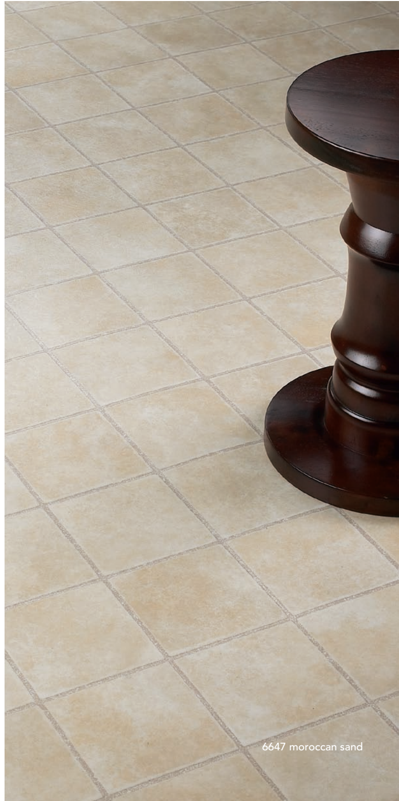
6647 moroccan sand